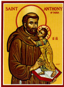
ST. ANTHONY OF PADUA PATRON OF SAILORS