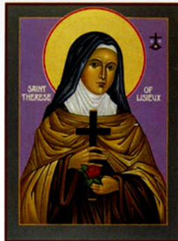
ST. THERESE OF LISEUX PATRON OF PILOTS AND AIR CREWS